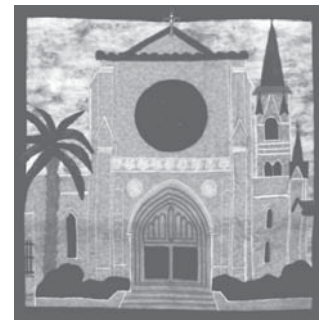
The Cathedral Centennial signature quilt shows the Cathedral in appliqué as central to the city.